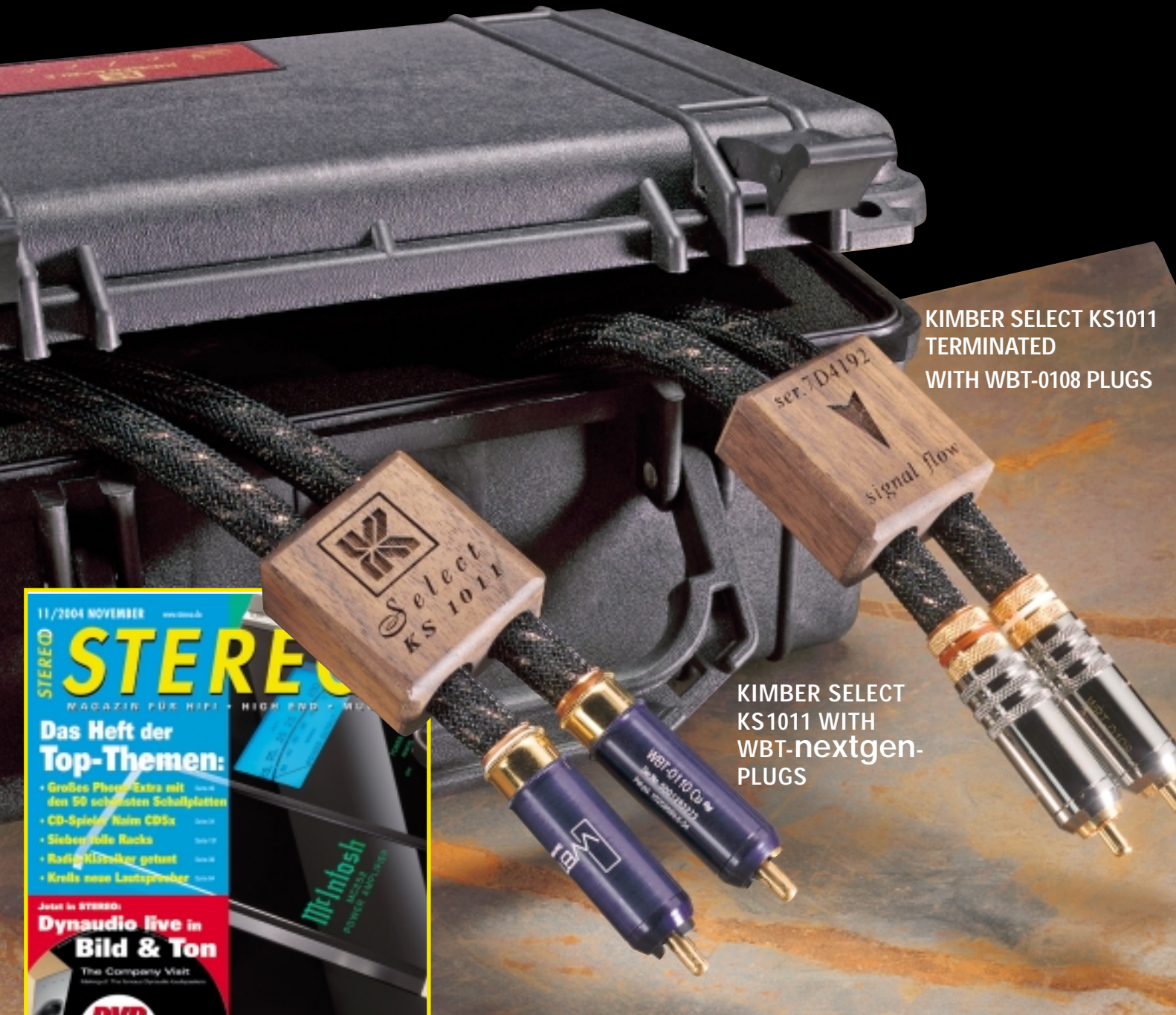
KIMBER SELECT KS1011 TERMINATED WITH WBT-0108 PLUGS