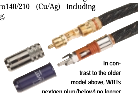
In contrast to the older model above, WBTs nextgen plug (below) no longer has an all-round ground contact.

To enjoy the best of both worlds, owners of Kimber Select interconnects should - or rather must - make sure that they have nextgen plugs on the end. In Germany alone, there are several hundred satisfied Select customers who could be even happier at minimum expense. This advice naturally also applies to the older KS 1010/1020 types. Kimber distributor B&D offers a customising service for Euro140/210 (Cu/Ag) including plug.